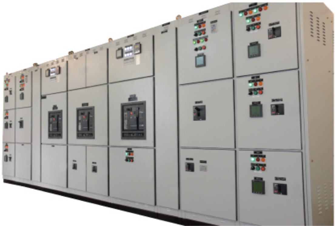
MCC - 2000A