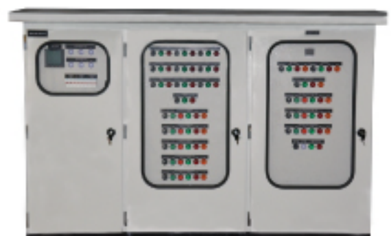
Hot Water System