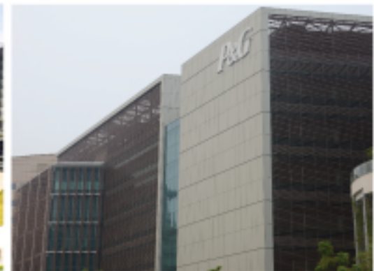
Singapore Innovation Center