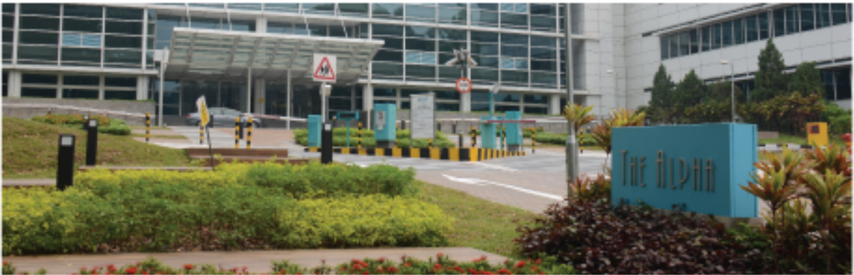
Alpha Science Park II