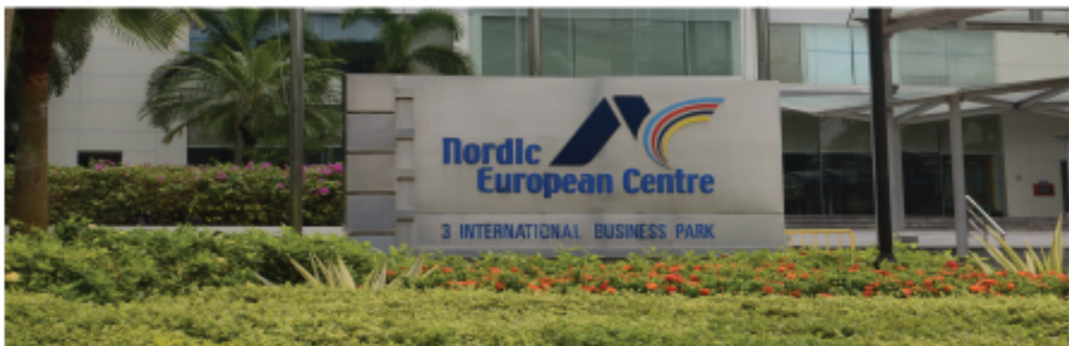
Nordic European Centre