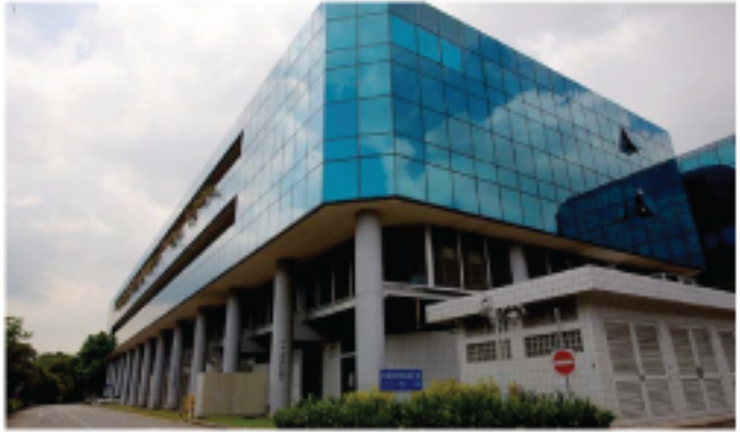
Cintech III, Science Park I