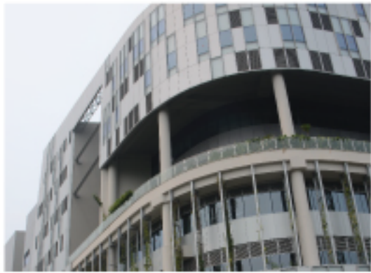
Nucleos @ 21 Biopolis Rd